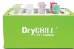
Item: DC4020 40 x 1.5/2.0 ml tubes