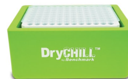
Item: DC9602 96 x 0.2 ml tubes or 1 x PCR plate