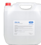
PDS-10L BS-040107-FK DNA/RNA Decontamination Solution 10l