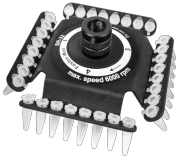
SR-32 BS-010205-FK rotor

Rotor for 2 x 8-section 0,2 ml microtube strips