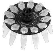
R-1.5 BS-010205-AK rotor

Rotor for 12 x 0.5 ml and 12 x 0.2 ml microtest tubes