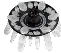
R-2/0.5/0.2 BS-010205-DK rotor

Rotor for 8 x 2/1.5 ml and 8 x 0.5 ml microtest tubes