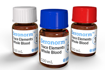
Seronorm™ Trace Elements Whole Blood